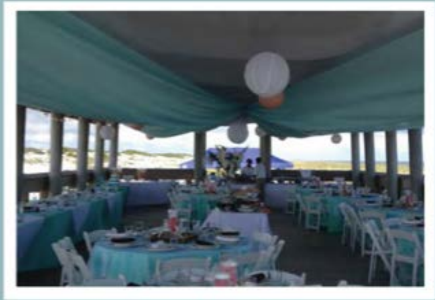
Decorated pavilion festooned by wind curving dune ridges