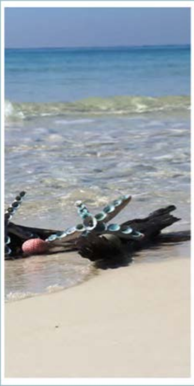
Dazzling seashells ornament on the beach