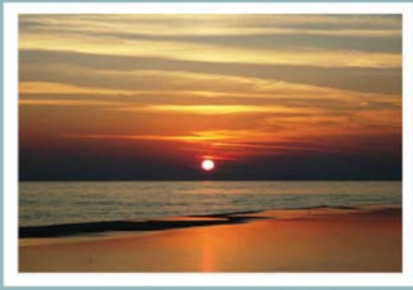
Idyllic sunset on the tranquil waters of the Gulf Coast

Book today to make your dream come true in ... the Real Florida ™.